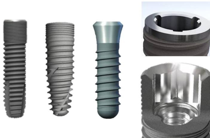
Figure 1 Different dental implants (Dentsply, BEGO Implant Systems, Straumann) and two variations of the geometric features for the dental implant insertion.

Thus, it can be concluded that the identification of a dental implant as a screw is justifiable.