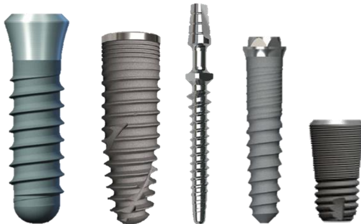
Figure 2 Variations of dental implant types used in dentistry

Main parameters that vary in terms of dental implants are diameter, length, shape (conical or cylindrical), thread design, surface topography, and connection geometry to the surgical instrument for implant insertion (see figure 2).